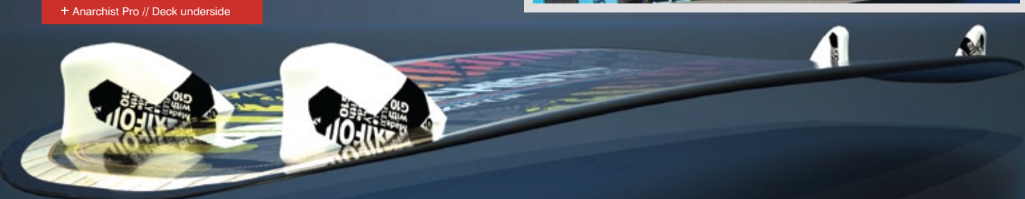
+ Anarchist Pro // Deck underside