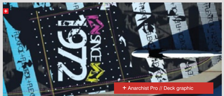
+ Anarchist Pro // Deck graphic

Our inserts are made from CNC'd milled Stainless steel. This means that the insert is made from one piece and is not welded together, providing a much stronger and safer insert.