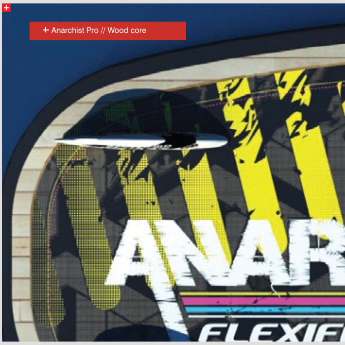
+ Anarchist Pro // Wood core

The Polonia core is laid up as a vertical laminate so the wood takes all the stress forces and not the glue. This means we get to use the flex properties of the wood and not the flex properties of the glue.